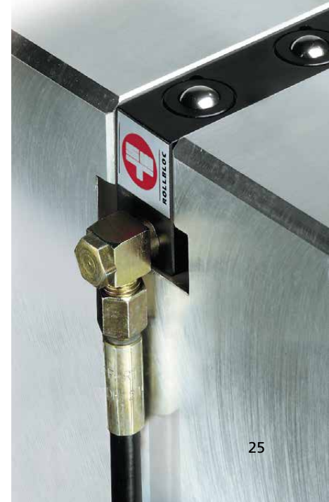
Short hose VSA with quick-disconnect coupling VKK